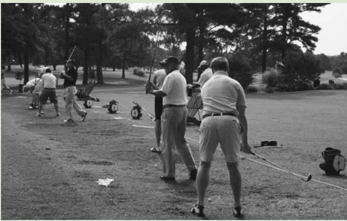
Warming up for a great day on the course

October 10th, twenty-two teams of golfers came out to "Hit the Greens for Scholarships" under sunny skies at the Country Club of Petersburg.