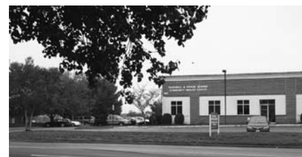
The Community Health Center is located at 4620 Crossing Blvd.

Besides primary care, funding from the John Randolph Foundation has enabled the Center to offer other services as well. Dental care, chronic disease management, behavioral health treatment, and wellness education are just some of the services offered in addition to assistance with enrollment into programs for free and low-cost medications.